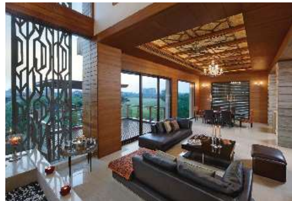
Actual pictures of Villa, Diplomatic Greens, Gurgaon