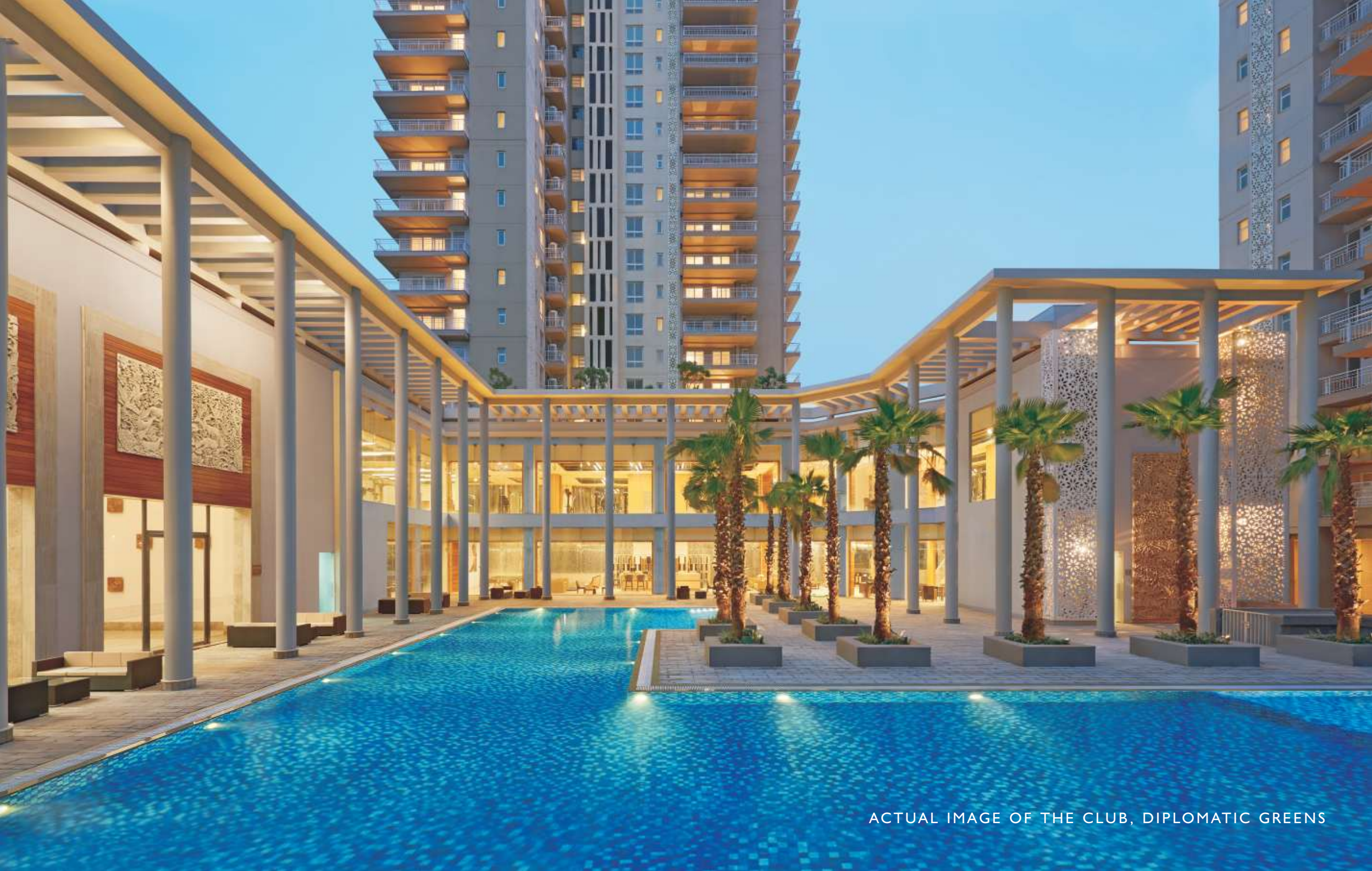
ACTUAL IMAGE OF THE CLUB, DIPLOMATIC GREENS