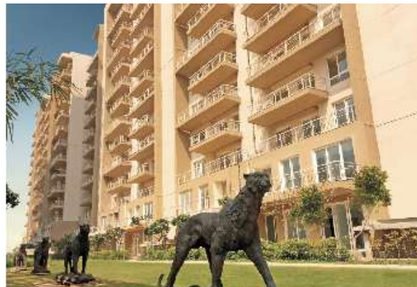
Actual pictures of Diplomatic Greens, Gurgaon