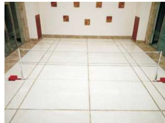
Indoor Badminton Court