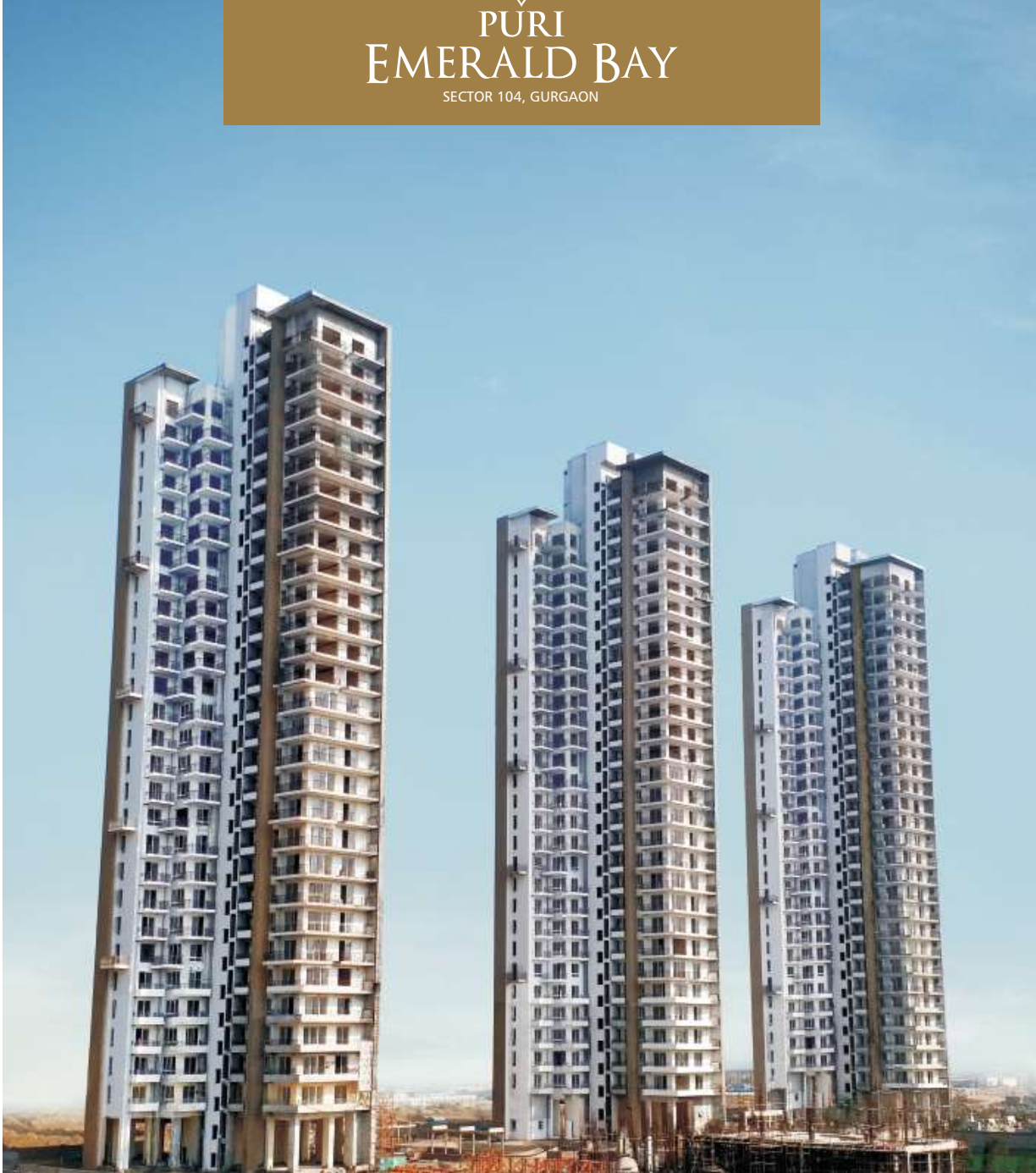
Actual picture of Emerald Bay, Gurgaon